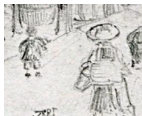
Figure 7: Details of sketch of Whitby Harbour , J.R.R. Tolkien, 1910. xxxviii