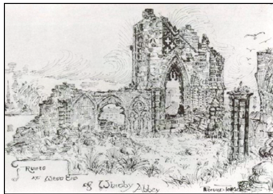
Figure 6: The Ruins of Whitby Abbey , J.R.R. Tolkien, 1910. xxxvii

Then as now, art was a part of general school education. To modern students, it would seem strictly regimented, taught by prescribed exercises and exams. By the end of his general school courses and the artistic education they provided, Tolkien's strengths and weaknesses as an artist were firmly in place. Two images drawn by Tolkien in 1910, at the age of 18, demonstrate this. First we have his pen sketch of The Ruins of Whitby Abbey . This elegant, brooding landscape piece is finely skilled; as with his later fiction, it uses darkness, hints of distant beauty, and the weight of the past as an integral part of its design. Compare it to Tolkien's pencil sketch of Whitby harbour, done during the same summer. This piece is strong enough – until the viewer notices the attempts at adding a few children to the streetscape. The small figures are so clumsily rendered that they seem out of place. Some time in the studio with some figure models might have rectified this, but this was not a part of a proper young person's drawing education in those days. Instead, students would have been presented with plaster parts of neutral anatomical areas, such as noses and arms. Any practice there added up to less than the whole, as the students themselves were known to remark.