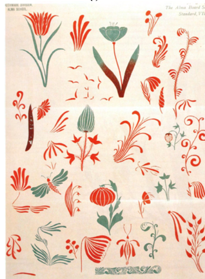
Figure 3: London School of Art practice sheet. "

Compare this to this practice sheet of designs for British art students to draw: