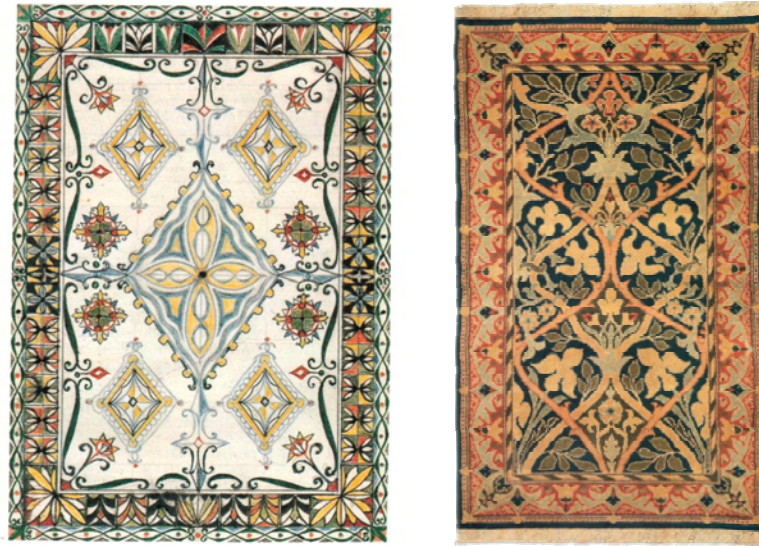
Figures 9 and 10. “Númenorean Carpet” by Tolkien xli contrasted with a William Morris design carpet. xlii