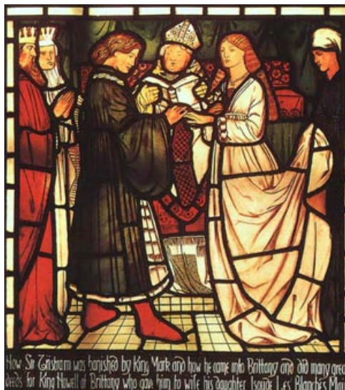
Figure 5: Stained glass, Burne-Jones, The Wedding of Sir Tristram , 1862 xxii

Artistically, this medievalism was expressed in different styles. The Gothic revival, the Celtic revival, and recaptured rusticity all strove to evoke the Britain of a simpler time, before both industrialism and colonialism.