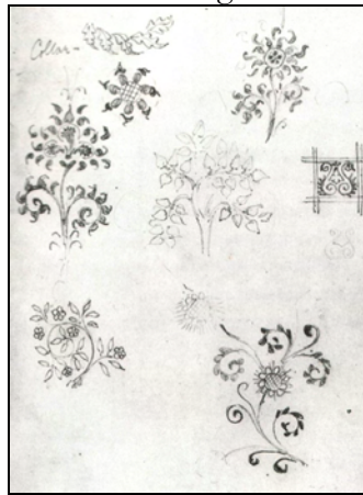
Figure 2: Sketches by William Morris, 1860s iv

The following sequence of three images, also closely linked in style and related to the Arts and Crafts movement, neatly demonstrates the pathway of this influence. First, a page of casual doodles by none other than the great William Morris: