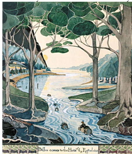
Figure 1: "Bilbo comes to the Huts of the Raft-elves", J.R.R. Tolkien iii

The quintessential Tolkien-and-Arts-and-Crafts image is one of his illustrations for The Hobbit , featuring Bilbo, as a diminutive figure on a barrel, being carried through a riverscape of flowing water and stylised trees. In its use of line, colour, and landscape, this appealing painting draws directly from Arts and Crafts stylisations.