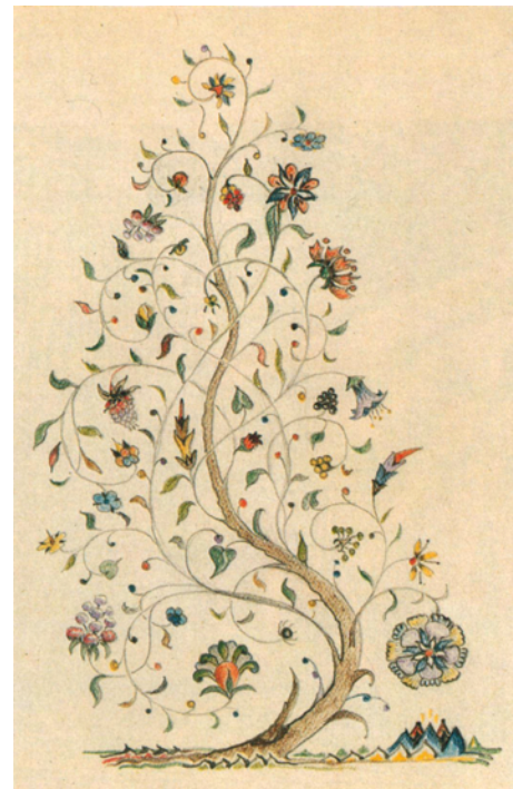
Figures 9 and 10: C.F. Voysey carpet design, lx Tolkien drawing “The Tree of Anarion” lxi

This C.F. Voysey carpet design of an elaborate tree is here compared to a Tolkien tree sketch. They both share curving lines and diverse leaves and flowers. Tolkien’s tree is more varied. His drawing is titled The Tree of Anarion , but it evokes a tree from another piece of his writing, the short story Leaf by Niggle . In this story, a great and glorious tree was persistently imagined by its artist, but never fully captured in paint, due to the artist’s procrastination and the demands of the outside world. After the metaphorical “journey of death,” lxii in the transcendent story, Niggle comes to a land where his Tree, the Tree that he imagined, existed. Looking upon his artist’s visualization made real, Niggle declares, “It’s a gift!”